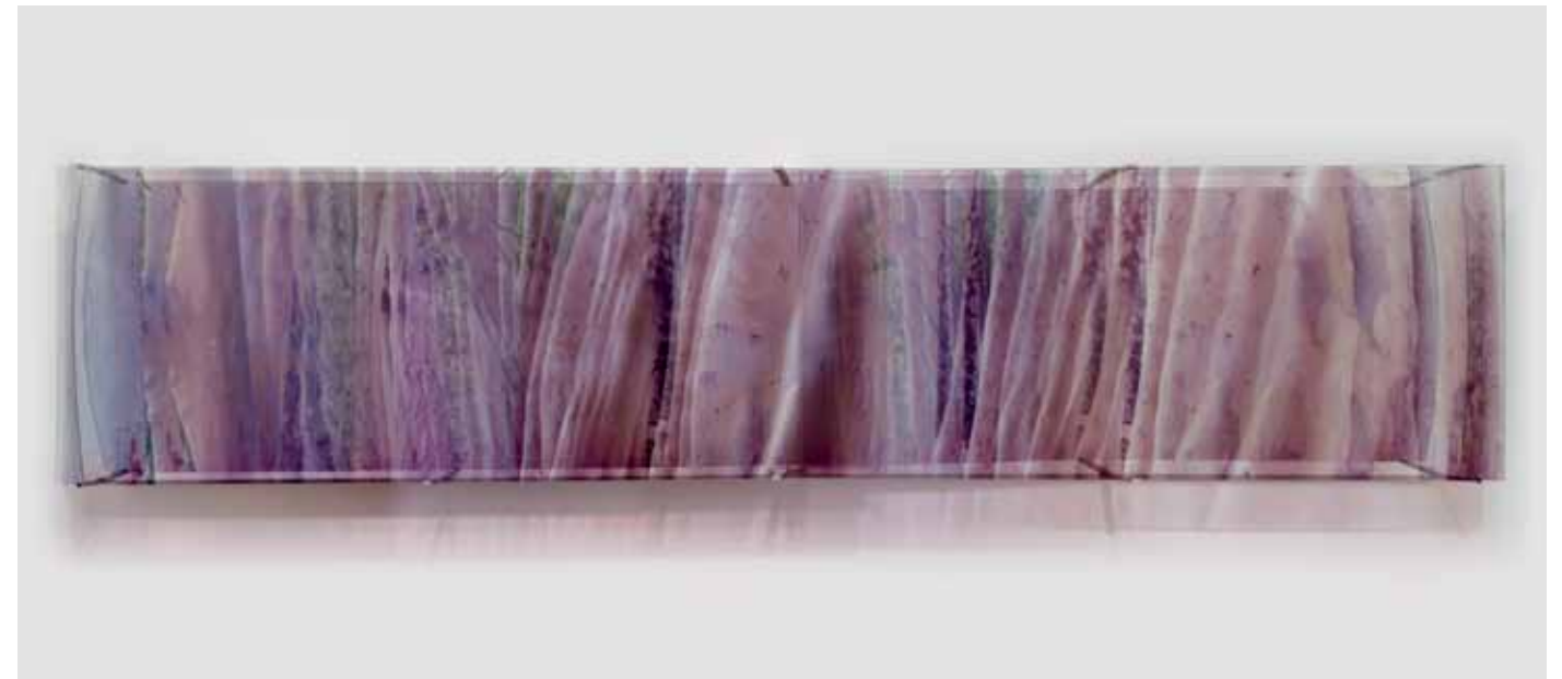
FOLLOWING: Forensic sublime (Crimes against the landscape series: Sixx Forest) 2008 mirror, oil glaze, Duraclear on Shikolite 100.0 x 455.0 cm