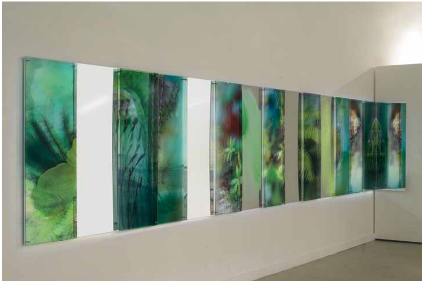
ABOVE Conversations with plants (The Tarkine, Tasmania) 2012 Duraclear on acrylic, Dibond mirror, oil glaze 120.0 x 650.5 cm