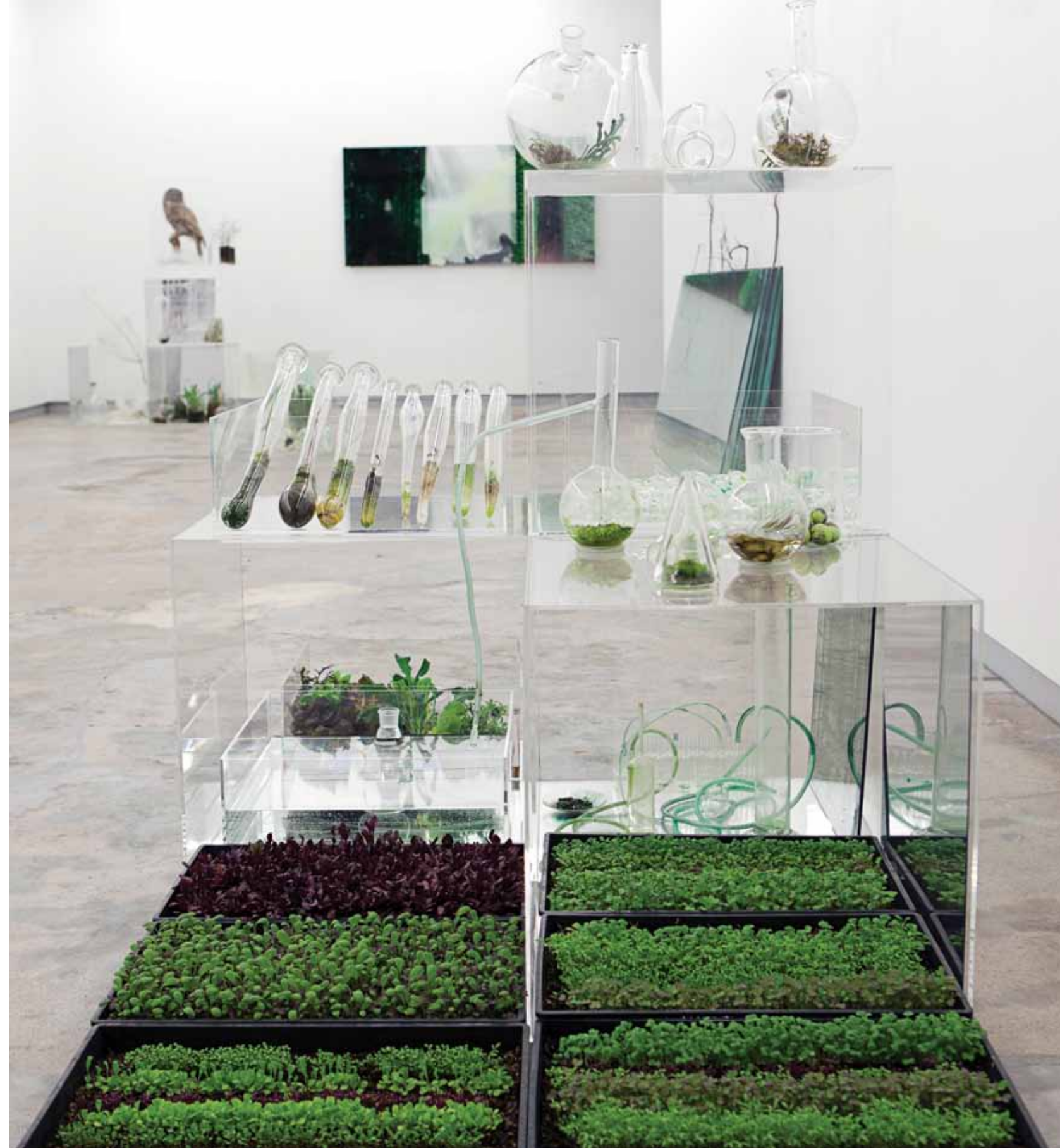
OPPOSITE Possibilities for a garden 2010 laboratory and handblown glass, plants, acrylic, silicon tubes dimensions variable Installation view, BREENSPACE, Sydney, 2010

In his compendium of human encounters with the class Insecta, Hugh Raffles invites us to imagine the lifeworld of an insect in spite of its profound otherness. Raffles writes of this difference, “We simply cannot find ourselves in these creatures. The more we look, the less we know. They are not like us.” 4 And plants? The Lemon-scented gum ( Corymbia citriodora ), synonymous with the famed drive in Cruden Farm which was designed by Edna Walling, extends its trunk by withdrawing nutrients from its lower branches which die and drop off. This deciduous process is not confined to trees; insect molting and the loss of human milk teeth are similar. 5 In the garden, young children can sometimes feel a kinship with plants that many adults would refuse. A sunflower’s nod toward the sun or a pea shoot tendril’s upward climb are responses they can, and will happily, copy. Still developing the capacity to categorise the things of this world according to the trinity animal/vegetable/mineral, the child recognizes that the plant’s task, like its own, is to grow.