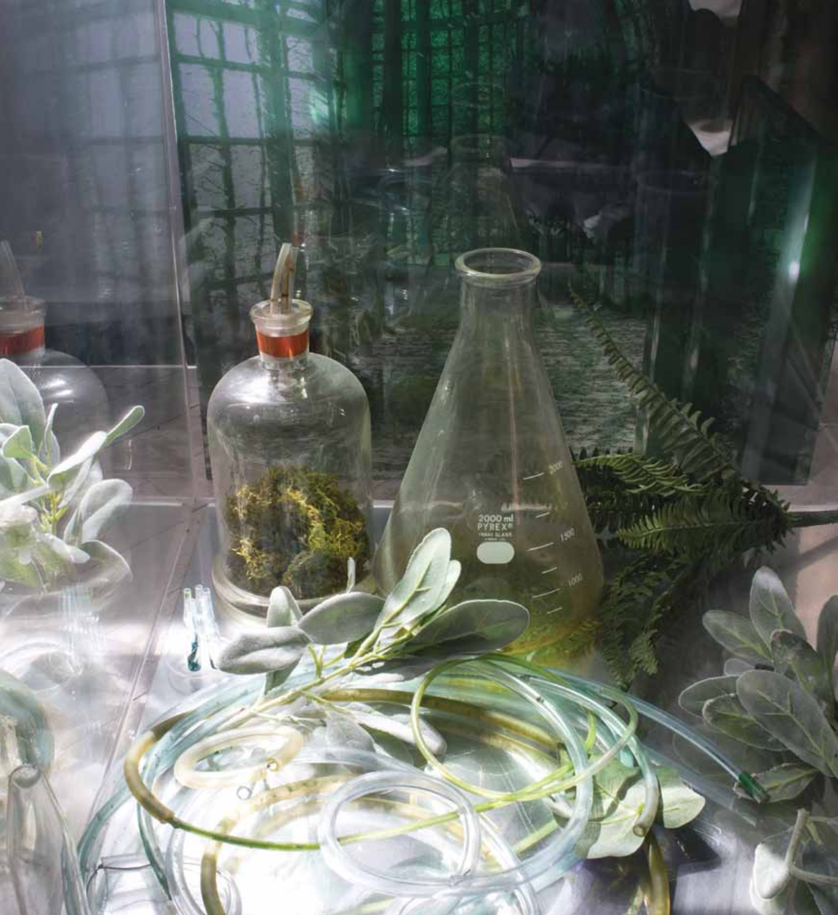
OPPOSITE: Anne ZAHALKA From the series Tabloteops 2012 (detail) PREVIOUS: The alchemical garden of desire 2012 (detail)