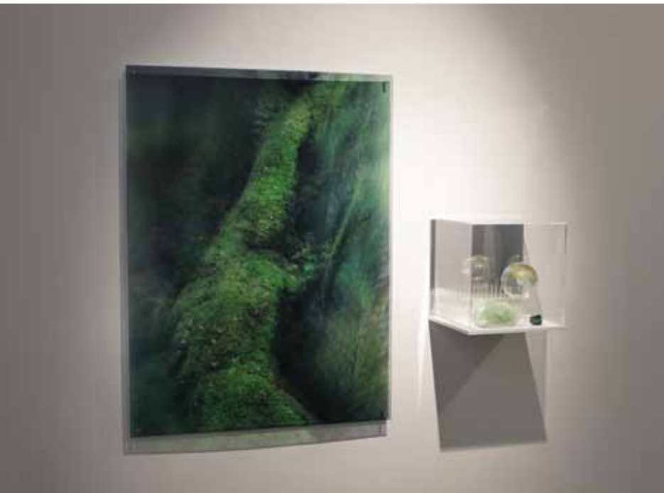
ABOVE Life of the Umavali (The Takine, Tasmania) 2012 acrylic, glass, oil pigment, wood, crystal, Duraclear, Dibond mirror 2 parts: 90.0 x 100.0 cm; 35.0 x 36.0 x 33.0 cm

What makes up this lifeworld of plants? All the components of climate—precipitation and temperature, humidity, atmospheric pressure—as well as soil composition and geological change, wind, disease, pests, pollinators, browsers, fire, and humans play a part.