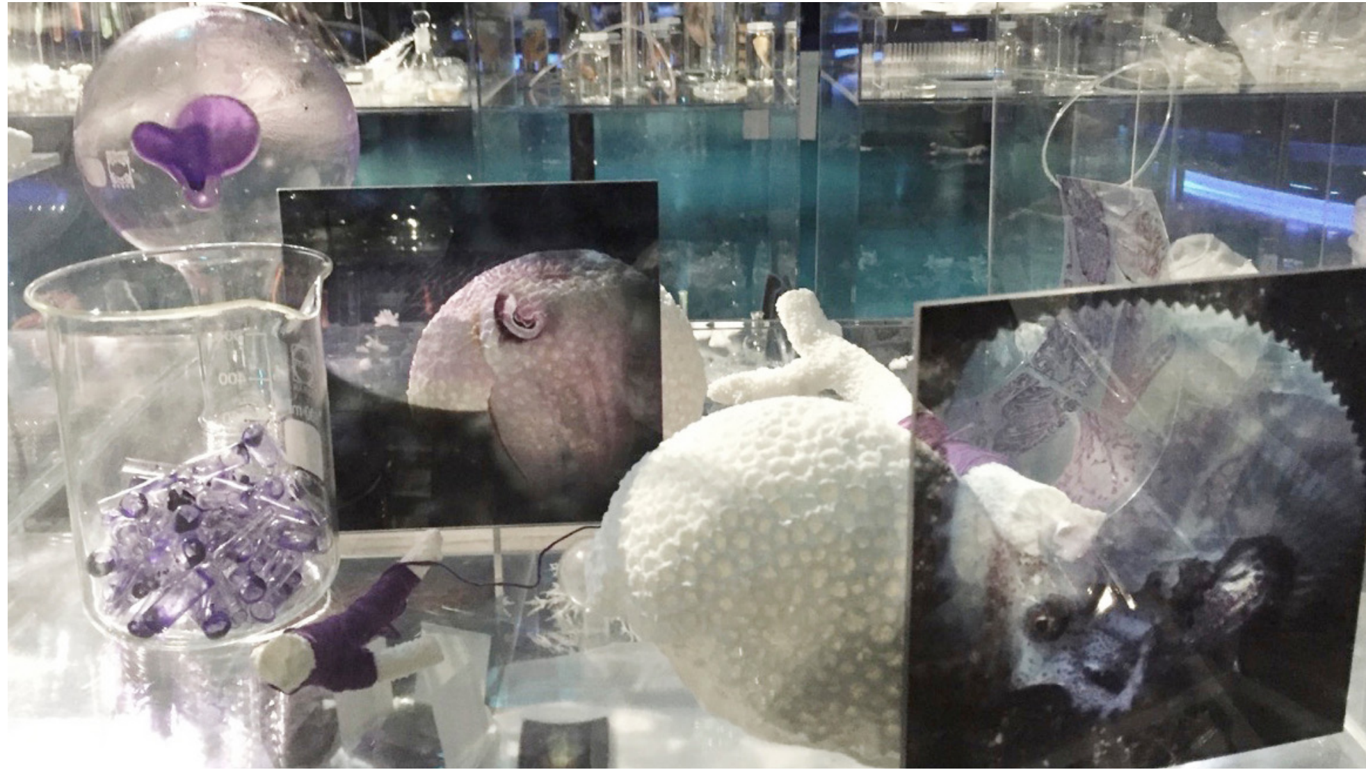
Above: specimens borrowed from the Australian Museum and Muséum national d'Histoire naturelle