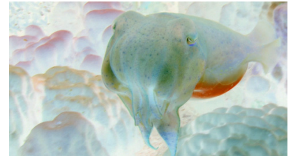
Above: Video stills - Deep Breathing 2015 screened at Palais de la Porte Dorée , Aquarium Tropical and Muséum national d'Histoire naturelle , Paris.

Video links: Deep Breathing - Resuscitation for the Reef (Part 1 & 2)