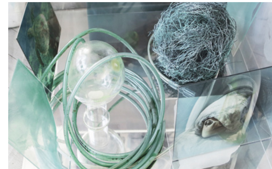
Above: Reef wards