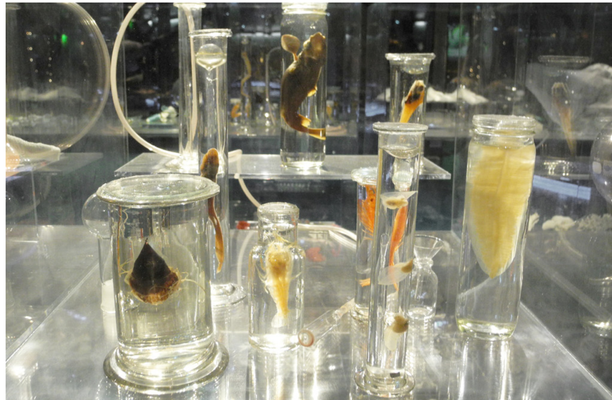
Above: specimens borrowed from the Australian Museum and Muséum national d'Histoire naturelle